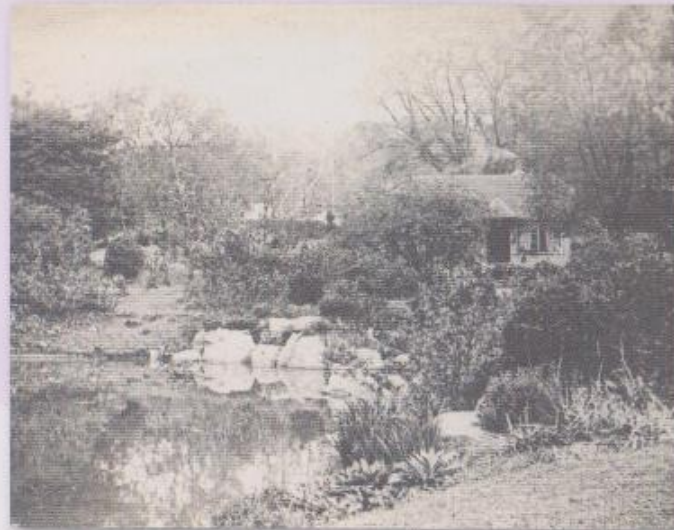
Pond Cottage c. 1896

The stable yard was placed out of the view of Coombe Wood House by building it in a small gravel pit. Just in front of the stable yard there is a small building called Pond Cottage which is older than the house and courtyard.